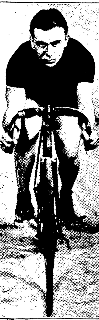
OTTO PETRI, GERMANY.